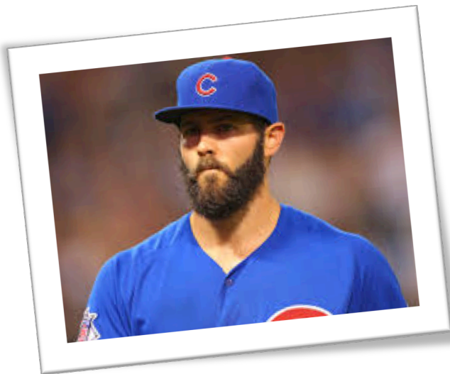
Road Warrior ace Jake Arrieta was 9-5, tied for the most wins in 2016, and had a 2.43 ERA, fourth in the league.