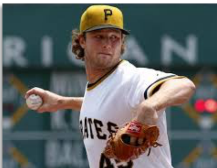
Otter P Gerrit Cole

Whatever Sam Dyson 's league-leading 37 appearances were the most by an OAPBA reliever since 2011, when the Otters Matt Belisle appeared in 37 games.