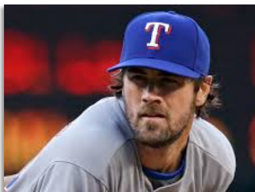
Lefty Cole Hamels (7-4, 2.10) became the first Beefer to ever win the OAPBA ERA title in the team's 27-year history.

The starting staff had a winning record of 30-29, 2.73, led by southpaw Cole Hamels (7-4, league-leading 2.10) and righthander Max Scherzer (7-7, 3.02). Michael Wacha (6-6, 2.17) was 5-1, 1.43 over the first half but reversed course at the halfway point, going 1-5, 3.04 over the second half. Johnny Cueto (6-5, 3.40) had a solid season and Dallas Keuchel (4-6, 2.80) participated in two combination shutouts, including a near no-hitter against the Otters in the final series of the season.