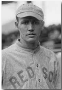
P Joe Wood Boston Red Sox