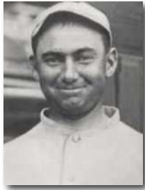
LF Duffy Lewis Boston Red Sox