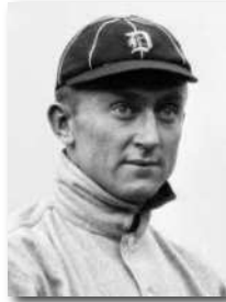
CF Ty Cobb Detroit Tigers