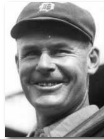
RF Sam Crawford Detroit Tigers