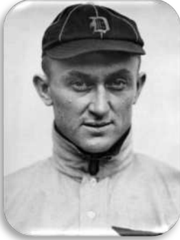
Ty Cobb, Detroit Most Valuable Player, hit .427

The American League top pitching award may have been named for Cy Young (who the 1911 season with Cleveland in the American League and ended with the lowly Boston Rustlers in the National League), but the honors went to Boston's Joe Wood , who had a spectacular second half and led the American League in strikeouts and shutouts.