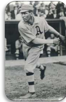
P Jack Coombs, Phila. 25-12, 1.72 ERA led AL

No other team in the league could match the A's starting pitching depth. The A's relied on a five-man starting unit led by Jack Coombs (25-12, league-leading 1.72 ERA), Chief Bender (20-6, 2.48) and Cy Morgan (19-7, 2.30, league-leading 135 BB). Rounding out Philadelphia's Big Five were veteran lefty Eddie Plank (17-11, 2.10) and lefty Harry Krause (14-7, 3.71). Combined, the Big Five were 95-43.