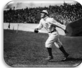
Sam Crawford, Detroit MVP runner-up drove in 157 runs

Crawford, hit .438 and drove in 56 runs in the Tigers first 39 games. He reached the 100 RBI plateau on July 12 and continued to batter AL pitching, driving in 57 more runs in the Tigers' final 68 games. Crawford had more explosiveness and power than Cobb, resulting in opposing teams intentionally walking him 37 times. He also excelled on defense with his strong arm usually preventing opposing teams from scoring or taking an extra base.