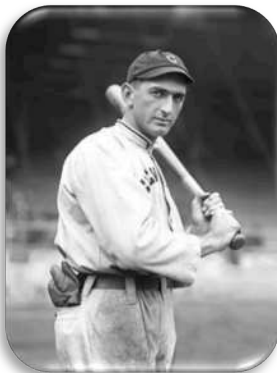
OF Joe Jackson, Cleveland .381, 46 doubles, 80 RBI

The Indians were in the thick of the pennant race through July 4 with a 48-30, .615 record, only four games behind the A's, but slumped to a 37-39, .487 record the rest of the way to finish sixteen games behind the A's and a third place finish.