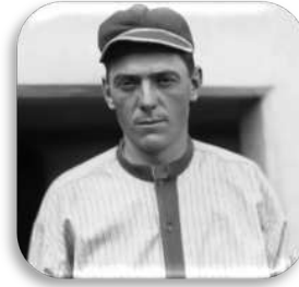
OF Clyde Milan, Washington .295, 105 runs, led AL with 73 SB

CF Clyde Milan (.295, 105 runs, league-leading 73 SB), 1b Germany Schaefer (.305, 53 RBI), and 2b Kid Elberfeld (.231, .393 OBP, league-leading 95 BB) were effective at getting on base. Behind them, however, the remainder of the hitters were not very consistent.