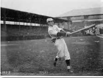
Joe Wood not only won the Cy Young award for his pitching, but his six home runs tied him for tenth place in the American League.

Altogether, American League pitchers hit 14 home runs in the 1911 AL replay. Wood's six home runs comprised nearly half (42%) of that total.