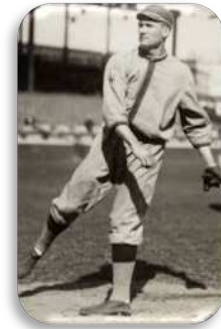
Walter Johnson, Washington 22-16. 2.10