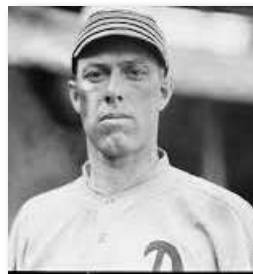
P Jack Coombs Philadelphia A's