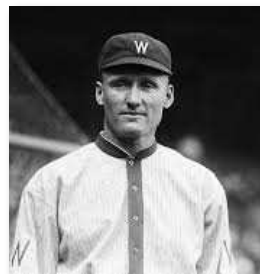
SP Walter Johnson Washington Senators