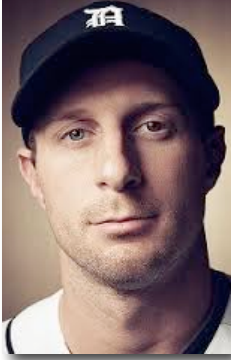
RHP Max Scherzer won two games as the Beefs made it past the Taz Devils in the playoffs first round.